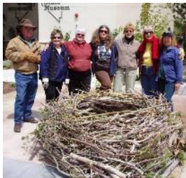
2010 Basket building at the State Museum in Carson City