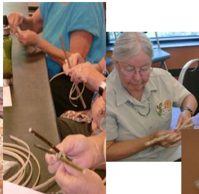
No idle hands in this bunch learning the "god's eye" at the August meeting

Important reminder Sep 15—No Workshop due to Flo Hoppe's Class on Sep 9, 10 & 11 The class is full.