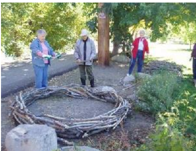
2006 Basket building at Idlewild

Arnies Arts 'N' Crafts and Lake View Hotel on Mackinac Island have teamed up to bring you the ultimate fall craft retreat. October 13th, 14th, 15th, and 16th