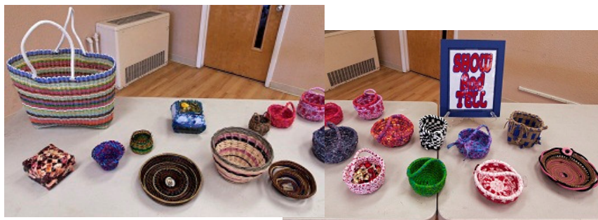
February show and tell—a group of busy bees

Set aside May 14-17 for our 2013 Retreat at Zephyr Point—sign-up during March meeting!! Keep an eye on your newsletters & website for date & location changes on upcoming programs & classes.