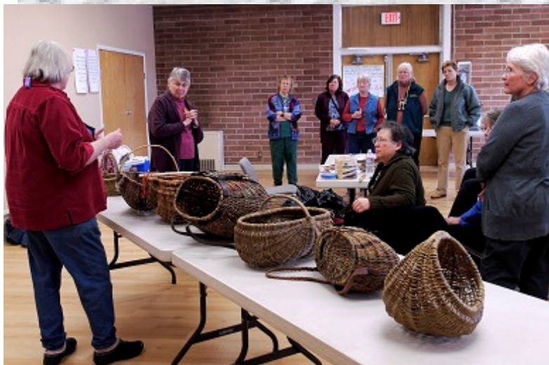
Great Basin Basketmakers