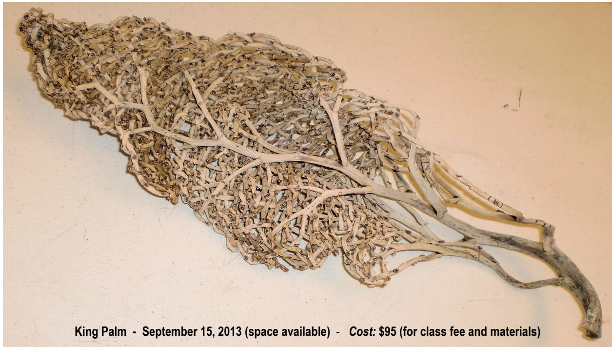
King Palm - September 15, 2013 (space available) - Cost: $95 (for class fee and materials)

Great Basin Basketmakers Post Office Box 11844 Reno, Nevada 89510-1844